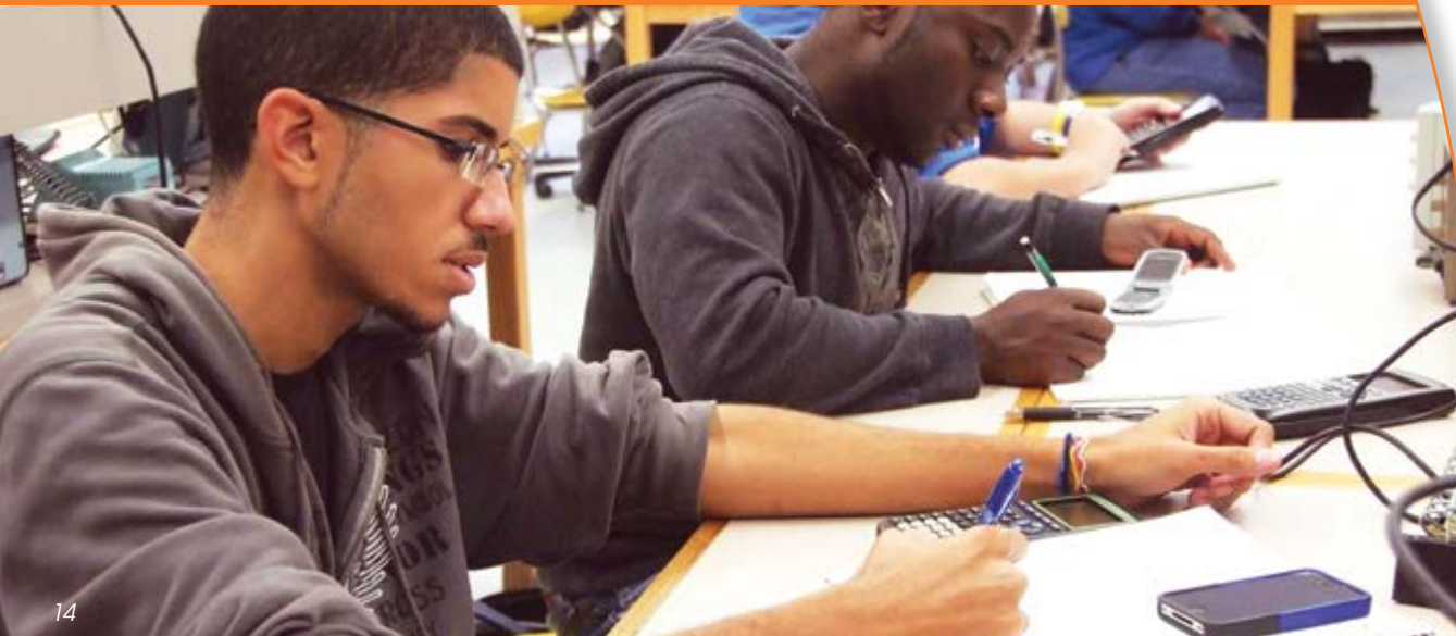
Students perform steps in algorithm.

The business disciplines at Gateway provide students with the solid foundation they will need to succeed in an intertwined and interdependent world, where business opportunities can be close to home or on different continents and often require newly-minted professionals to travel through uncharted waters.