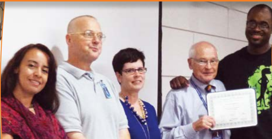
RET II graduation.