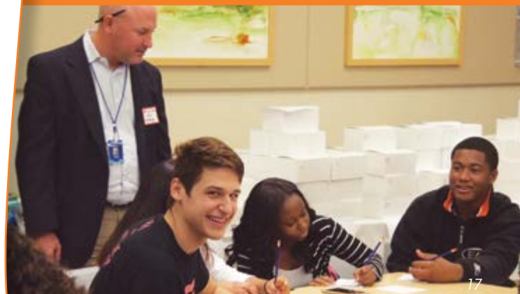
Students from local high schools participate in GCC program.