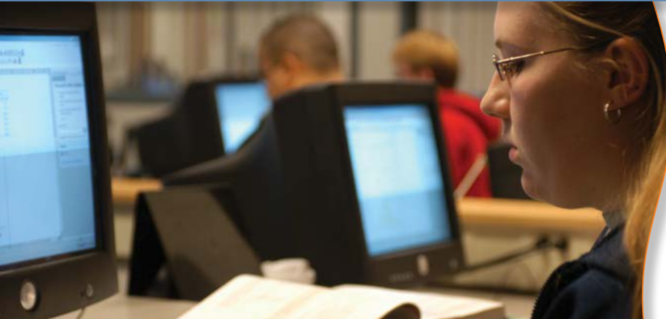
Developing a business strategy.