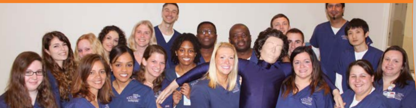
Students in Gateway's Radiography program.