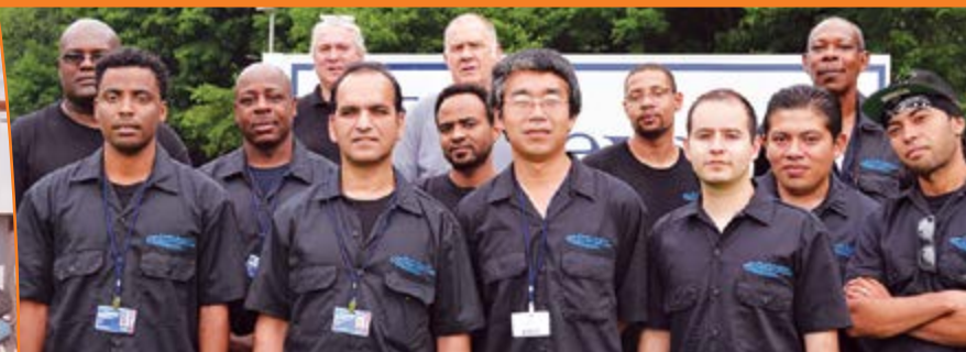
Small Engine Repair & Technology program graduates.