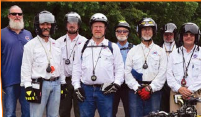
Motorcycle riding education.