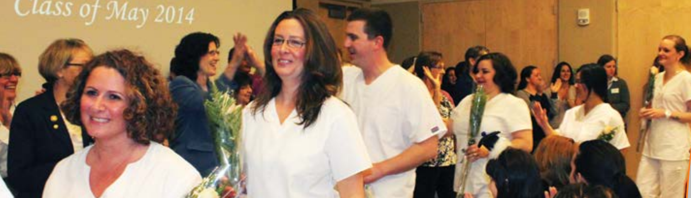
Graduates of Gateway Community College's Nursing program.