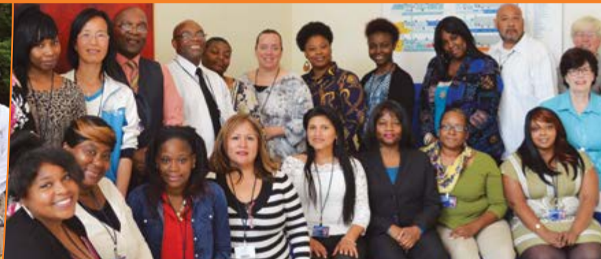
Community Health Worker program participants.