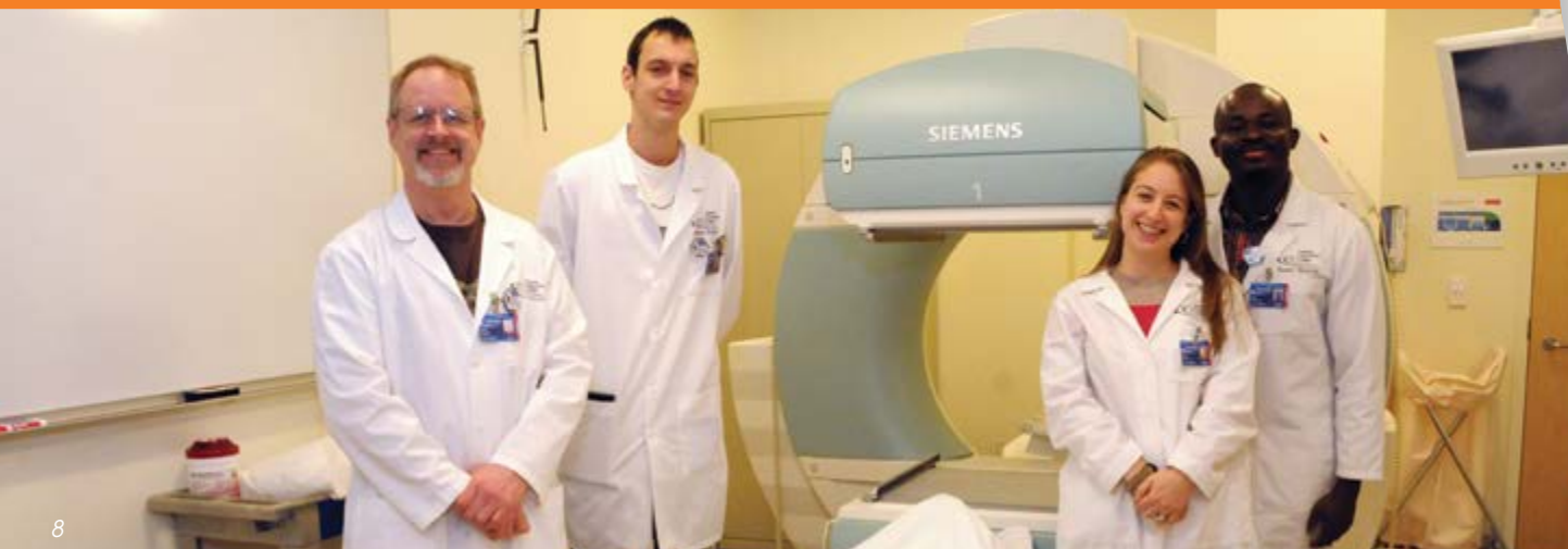
Nuclear Medicine Students.