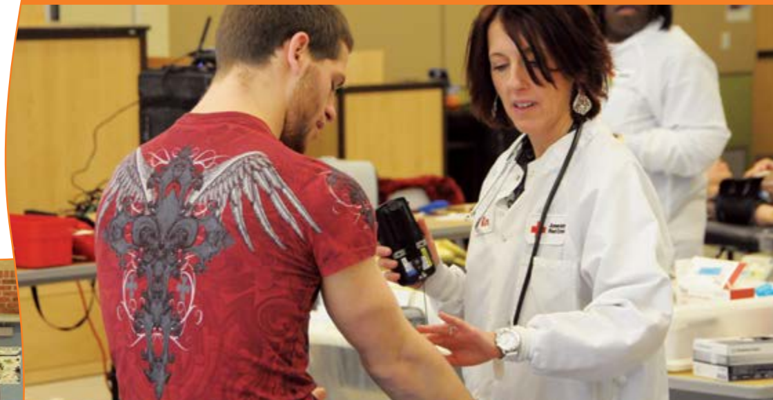
Annual Red Cross blood drive, among the many events held in the Curran Community Center.