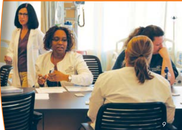
Nursing students prepare their assignment.