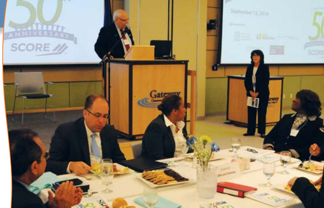
50th Anniversary of the New Haven Chapter of SCORE.

The Gateway Community College Foundation is administered by a Board of Directors composed of community leaders representing many walks of life and career pursuits. Their voluntary efforts, and the incredible commitment of businesses, organizations and individuals throughout the region provide connections that, each and every day, are changing lives and building futures.