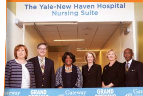
Yale New Haven Hospital Nursing Suite Ribbon Cutting Ceremony.