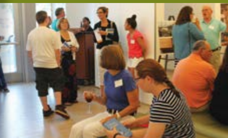
Book Signing Reception.