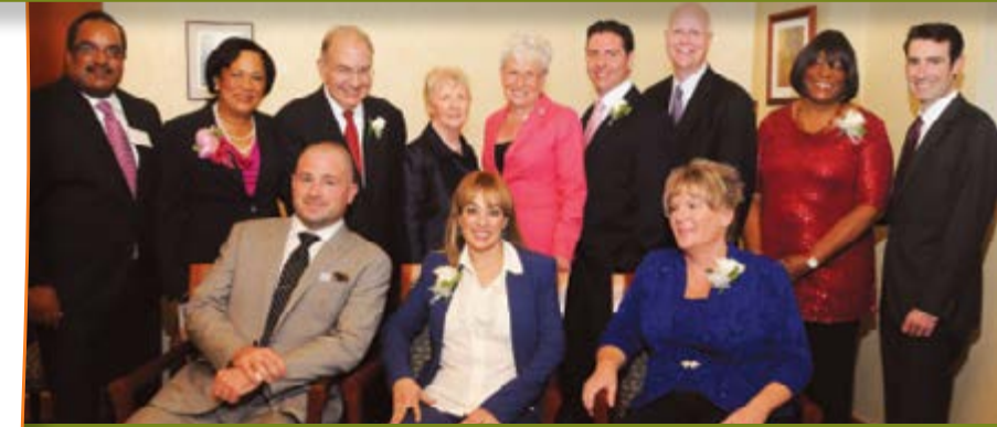
Hall Of Fame inductees.

Each year, the GCC Foundation honors exceptional corporate individuals, community leaders and Gateway alumni for their profound commitment to, and support of, the College's dynamic educational mission. The signature event brings the community together, reaffirming Gateway's unique role and looking ahead to the influence and impact that each succeeding class of graduates will have on their individual and collective futures, and ours.