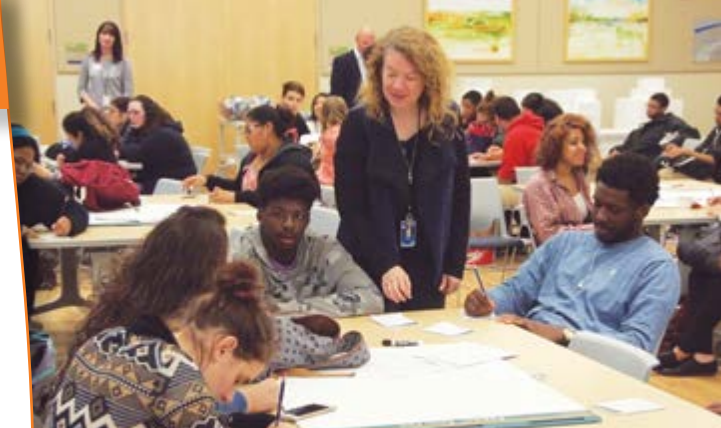
High school students attending session at Gateway.