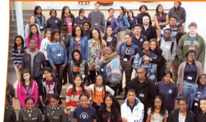
Middle College students.