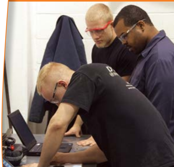
GM ASEP students practicing their diagnostic skills.