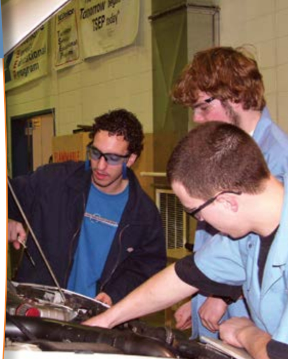
Automotive students performing vehicle inspections.

Automotive students have the unique opportunity to develop their skills through participation in the General Motors Automotive Service Education Program (ASEP). This unique, cooperative initiative prepares students for a challenging career in a General Motors or AC Delco sponsored automotive repair facility. Students attend classes and labs at the North Haven Campus, receiving state-of-the-art instruction on current General Motors' products, and work full-time at a sponsoring GM or AC Delco shop. GM provides Gateway with diagnostic equipment, educational materials, shop equipment and vehicles for students to work on. Donated vehicles include new Cadillacs, Buicks, GMCs and Chevys including a high-tech 2014 Corvette Stingray. This education/industry partnership helps Gateway students launch rewarding careers while meeting the staffing needs of local industry.